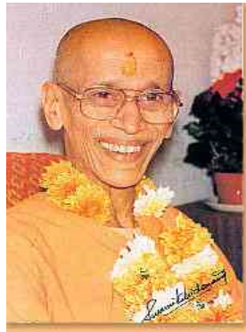
HIS HOLINESS SRI SWAMI CHIDANANDA

Election Day – Take the Gita with you (See Article on Page 13)